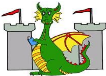
Learning Castle Children's Center L LC